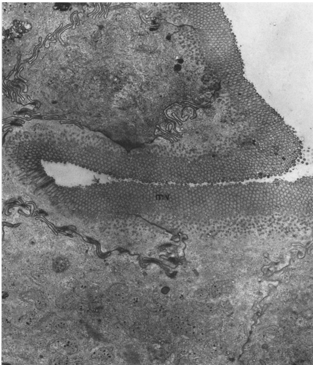
FIGURE 1 A part of the apical portion of several duodenal absorptive cells of a rat that had received gastric infusion of ferrous chloride 1 hour before being killed. Many dense granules are seen in the mitochondria. mv , microvilli. \times 9,600 .

the mitochondrial particles in the control rats. Besides these characteristic dense granules, numerous fine particles are also observed dispersed in the mitochondrial matrix as shown in Fig. 3. These fine particles may have approximately the