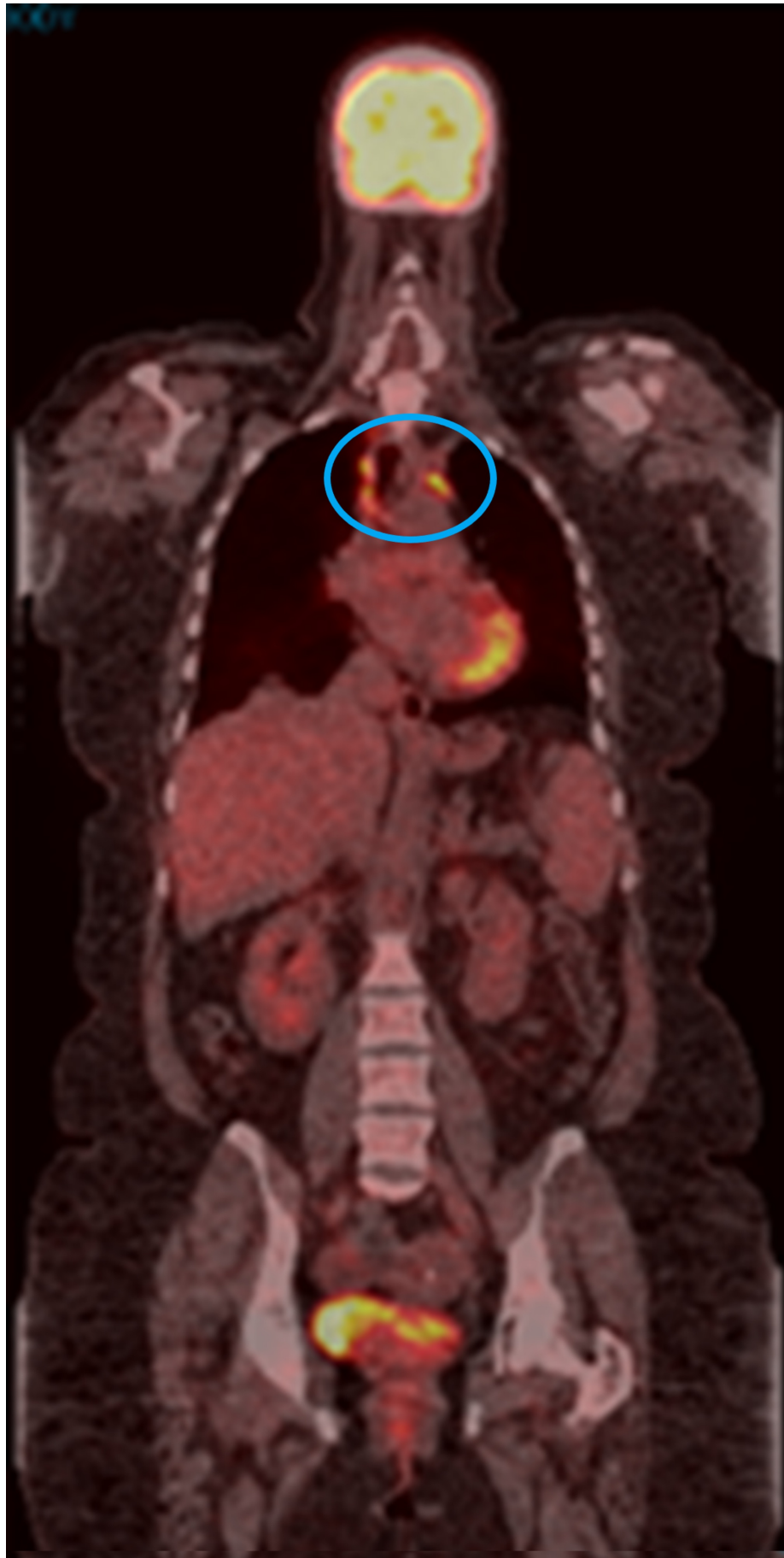
FIGURE 3: PET/CT scan in September 2017