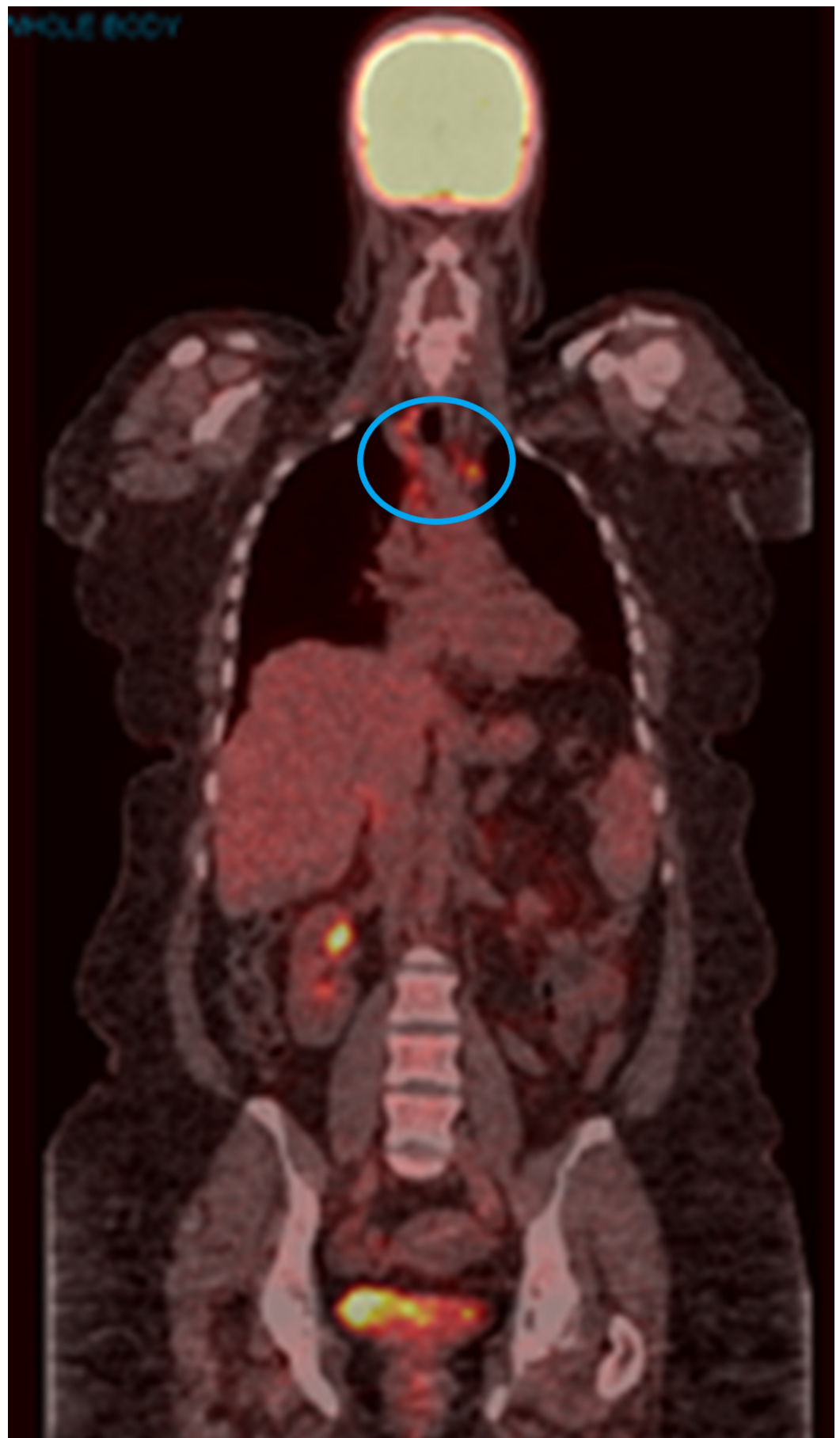
FIGURE 4: PET/CT scan in November 2018