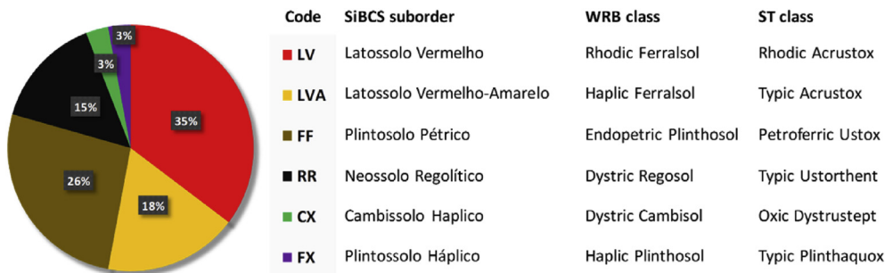
Fig. 2. Soil observations according to the Brazilian Soil Classification System – SiBCS [1] and corresponding World Reference Base – WRB [2] and Soil Taxonomy – ST [3] classifications.

The soil samples were air-dried, ground and sieved (2 mm mesh) and analyzed for physical and chemical determination according to Embrapa [5]. The spectroscopic analysis was conducted using the