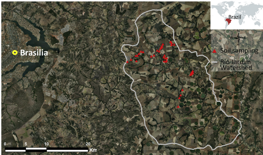
Fig. 1. Dataset location, soil sampling points and aerial photography with natural color composite.