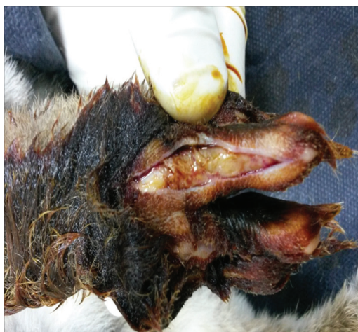
Figure 2: Macroscopic evaluation of adhesions in group 1a without topical treatment with 5-fluorouracil.