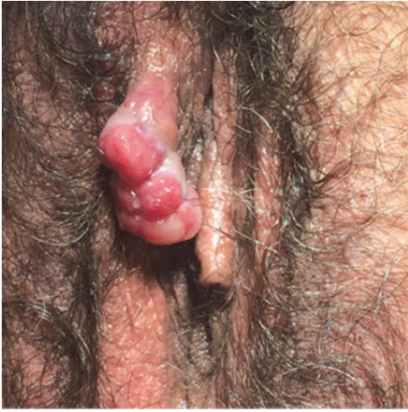
FIGURE 1: Image of the vulvar lobular capillary hemangioma.