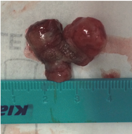
FIGURE 2: Vulvar lobular capillary hemangioma after excision: specimen sent to histopathological examination.

PG is a lesion of the skin and mucous membranes and it can be seen in various locations of the body. A 10-year retrospective analysis of 86 cases from Akamatsu et al. showed that the head and neck area, including the oral cavity and nasal mucosa, were the most commonly affected sites (56%, n = 46 ), followed by the upper limb (22%, n = 18 ), trunk (16%, n = 13 ), and lower limbs (6%, n = 5 ) [2]. On their report no vulvar cases were described.