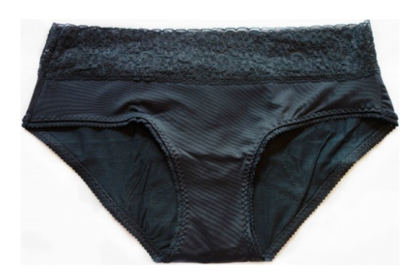
Figure 1 Thinx® brand menstrual underwear, Hiphugger style.

The product used in this study has four layers in the areas which collect menstrual blood. The first layer, closest to the