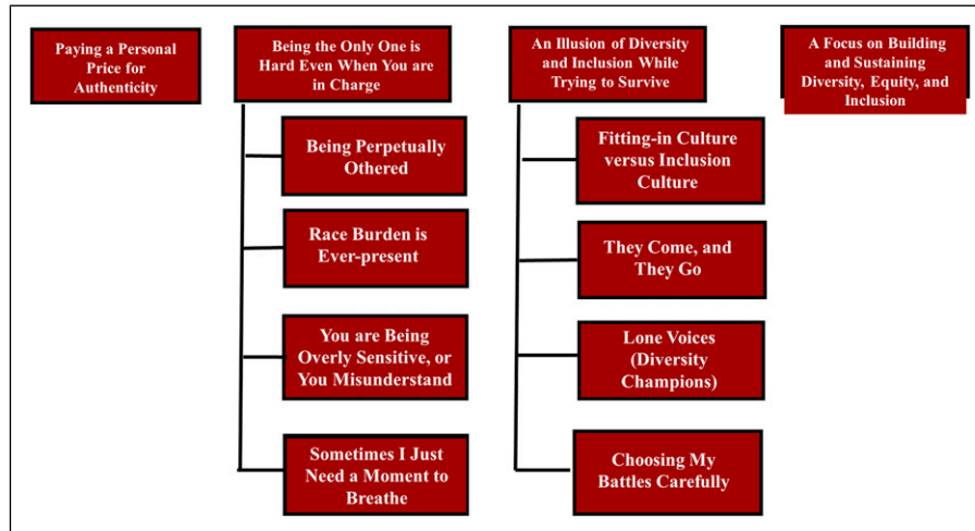
Figure 1. Themes and Sub-themes. There were four overarching themes found in the analysis. Two of the themes had four sub-themes each, for a total of eight sub-themes.

they want you to be.” “If you make a big deal of it, you pay a steep price,” declared participant Lori in her interview.