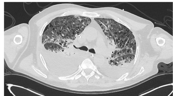
Fig. 1 CT scan at hospital admission. Chest CT scan shows extensive bilateral pulmonary infiltrates with large pulmonary effusions and mediastinal lymphadenopathy

Unfortunately, the patient's condition worsened rapidly and he died seven days after the onset of respiratory failure requiring intubation and ventilation, and six days after starting treatment with liposomal amphotericin B, which is the treatment of choice for severe histoplasmosis (and visceral leishmaniasis).