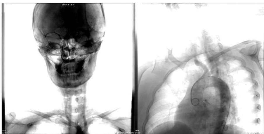
Figure 4 Digital subtraction angiography (DSA) showing occlusion of the right subclavian artery and narrowing of the right internal carotid artery.

excluded by the negative transthoracic echocardiogram, although a transesophageal echocardiogram with bubble study was not done. There was a similar case reported by Kato et al. who suggested a stump of the occluded common carotid artery leading to turbulence of blood flow as a possible source of embolization [6]. We also suspected the coexistence of a hypercoagulation state in our patient. In our review of the existing literature, some studies suggested that Takayasu arteritis itself could cause an overactivation of the coagulation system via different pathways [5,7,8]. In the meanwhile, there are reported cases of Takayasu arteritis where the antibodies of antiphospholipid syndrome were also positive [9-12], which were related to more severe clinical courses. In our case, the antiphospholipid antibody itself was negative, but there are other entities of antiphospholipid syndrome that we failed to test for due to an availability issue [13]. The positive antinuclear antibody result also raised suspicion of autoimmune disorders such as SLE, which could cause hypercoagulation as well. Thus, the empiric anticoagulation therapy was warranted.