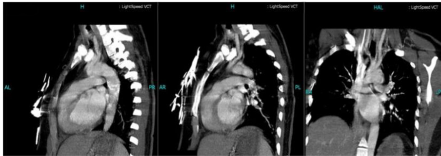
Figure 3 Thoracic and abdominal computed tomographic angiography (CTA) was negative.

Twenty days after admission, the clinical condition of the patient was stable, and she was subsequently discharged.