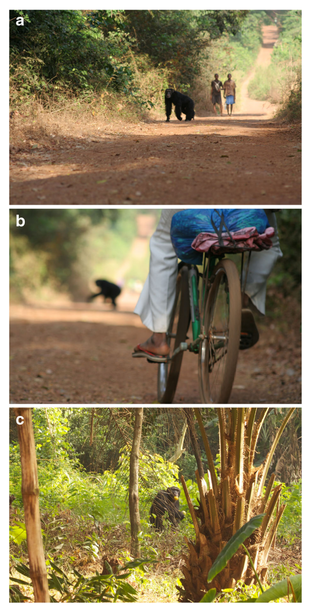
Fig. 2 a Local people and chimpanzees encountering each other on a road in Cantanhez National Park (photo by K. Hockings). b A cyclist passing a chimpanzee that is crossing the road in Cantanhez National Park (photo by K. Hockings). c An adult male chimpanzee transporting cultivated oranges in an agricultural field next to the village (photo by J. Bessa).

complexity of factors influencing the availability and management of resources in CNP, as well as limited data on overlapping habitat and resource use by people and chimpanzees, impelled us to design and implement a mixed-methods approach. We explored these dynamics from a multispecies perspective, combining ethnoprimatology with multispecies ethnography, which further integrates anthropological and biological approaches.