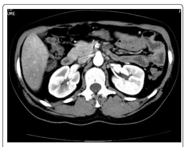
Figure 3 Abdominal computed tomography scans.

Acute mesenteric ischemia is a rare abdominal emergency that usually requires wide intestinal resection and carries a high mortality rate (Table 1[7-13]) with the adverse effects of short-bowel syndrome in the surviving patients [6]. A critical point that influences the survival