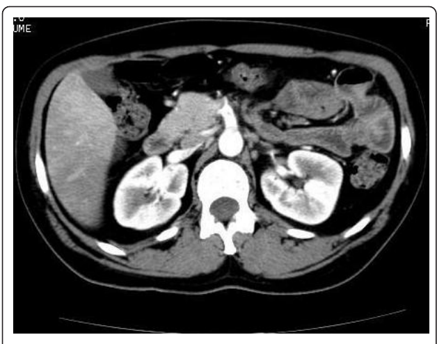
Figure 2 Abdominal computed tomography scans.

the deficiency of this enzyme is associated with an increased risk to develop massive thromboembolic events) was negative (no mutations). She was discharged from our unit after 37 days without any complications. After three months, the patient had a surgical procedure for restoring the bowel continuity. The patient was evaluated after one week, and one, three, and six months after discharge with blood and coagulation examinations, abdominal ultrasonography, Doppler ultrasound, and abdominal CT scan. She was asymptomatic and stayed well. At one year, we had successfully restored the bowel continuity without complications.