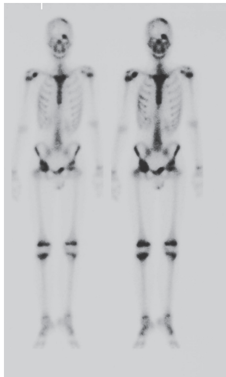
FIGURE 3: Bone scintigraphy showing multiple lesions in the left frontal bone, sternum, right superior supraclavicular fossa, and iliac bone, suggesting fractures, inflammation, or malignant cells.