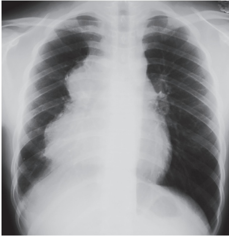
FIGURE 1: Chest X-ray showing an anterior mediastinum mass.

tumor did not change, as evident in a computed tomography (CT) scan. Next, tumorectomy and total right lung extraction were performed. The pathological diagnosis of the extracted tumor was malignant teratoma with areas of yolk sac tumor (Figure 2). No cancer cells were found at the edges of the area where the tumor was removed. Two courses of cisplatin-based postoperative chemotherapy were administered until AFP levels were normal.