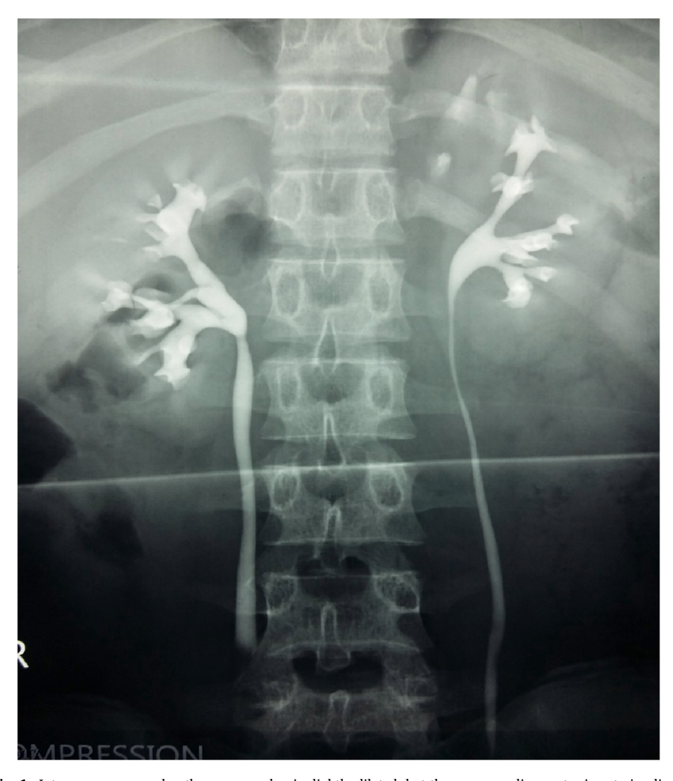
Fig. 1. Intravenous urography: the upper pyelon is slightly dilated, but the corresponding ureter is not visualised.

impaired.<sup>1,5</sup> We performed ureteral reimplantation due to relatively good renal function on IVU and incontinence. Ureteral reimplantation may be performed as a conservative primary approach because it is a