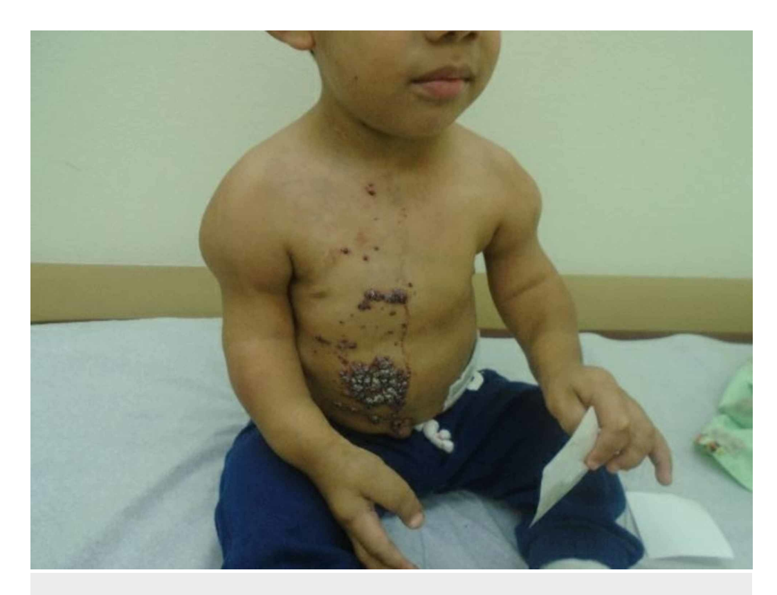
FIGURE 1: Hyperkeratotic, dark red vascular appearing papules coalescing into plaques on chest and abdomen

Biopsy of one of the lesions demonstrated marked hyperkeratosis with dilated, blood-filled, endothelial-lined spaces presenting immediately beneath the epidermis, consistent with an angiokeratoma (Figure 2). Due to the asymptomatic nature of the angiokeratomas, treatment was not performed.