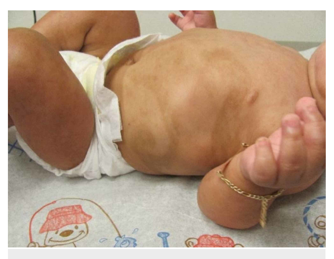
FIGURE 3: Segmental, streaked, and whorled, hyperpigmented

Interestingly, our patient had previously presented to our dermatology clinic at seven months of age with segmental, streaked and whorled, hyperpigmentation over his trunk that was suspected to be an expression of genetic mosaicism (Figure 3).