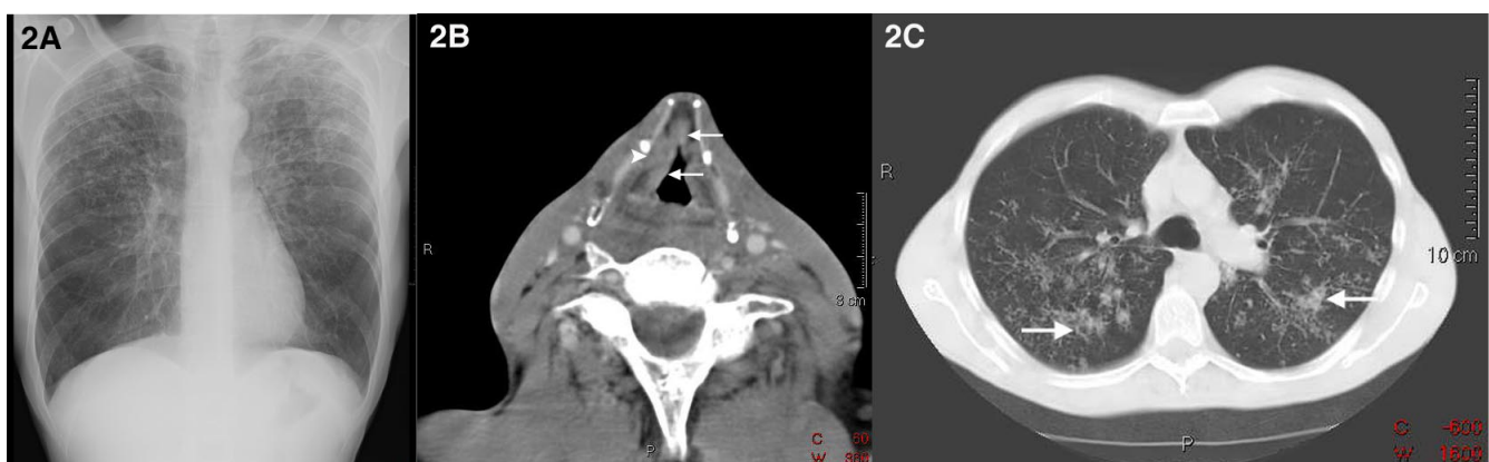
Figure 2 Radiography. (A) Initial antero-posterior chest X-ray. Miliary nodules predominantly bilaterally distributed in the upper parts of the lung parenchyma. (B) Axial contrast-enhanced computed tomography image of the neck: enhanced mass (arrows) in the false vocal cord which extends into the anterior commissure and obliteration of the paraglottic fat (arrowhead). (C) Axial high resolution computed tomography image of the chest: diffusely distributed interstitial nodular alterations with formation of central cavities (arrows).