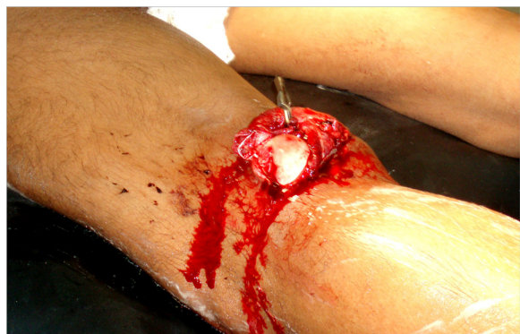
Fig. 3 Left popliteal artery injury secondary to posteriorly dislocated distal femoral fracture in a victim of road traffic accident