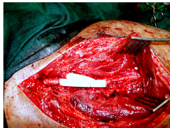
Fig. 4 Arterial and venous repair was done in a patient with traumatic injuries involving femoral artery and vein

injuries [5] and carries the greatest rate of limb loss [6]. Our centre receives patients from all parts of Pakistan and adjoining war afflicted areas such as Afghanistan. The scarcity of trauma surgeons' especially vascular surgery services in remote areas and lack of effective ambulatory services in our country causes delay in the initial presentation of these patients. Time of presentation is a very essential prognostic marker of limb and overall survival [7]. Since the duration of presentation has a significant effect in delaying primary revascularization and limb loss [8], our study also shows that majority of the patients in whom the limb could not be salvaged presented after the crucial 8 hours of injury. Clinical examination was the initial approach among all the trauma patients and the use of contrast imaging modalities such as arteriography were reserved in cases with absent hard signs of vascular injury. Associated nerve and orthopaedic injuries contribute as added factor for morbidity and mortality in patients with vascular trauma as highlighted by McNamara et al [9] and by Desai P et al [10] too. In a study conducted by Topal AE showed that in patients presenting with trauma, 31.4 % associated bone injuries and 16.4 % had nerve injuries [11], as were found in our patients.