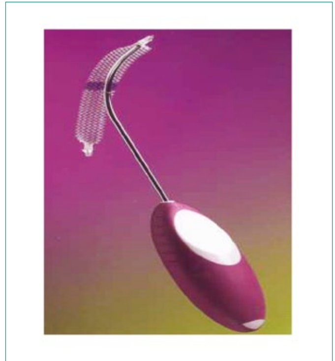
Figure 2. Mini Arc.