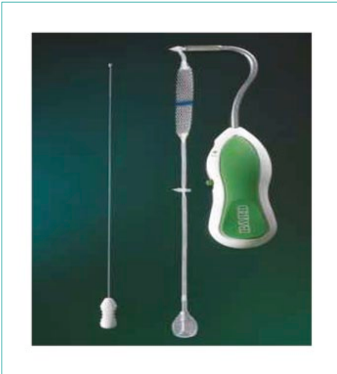
Figure 1. A-Just.

There was major improvement in all the women after the surgical procedure. The effectiveness of the procedure was assessed on the basis of the urinary stress test and the VAS. After the removal of the catheter, 115 patients were able to urinate properly and were fully able to retain their urine during a gynecological examination and urinary stress test. In the case of 25 patients, there was a major improvement with significant reduction of SUI symptoms rated on the basis of interviews and the VAS. In 9 cases, temporary urine retention occurred and confirmed by USG examination (5 with TVT-Secur tape, 3 with Adjust tape, 1 with Mini-Arc tape). For these cases, Foley catheters were inserted into the bladder for a period of 5 to 7 days. In one case, as a result of chronic urine retention, the patient was discharged home with the catheter in place (a TVT-Secur recipient). The catheter was removed 14 days later at our department. During this time the patient passed urine normally. In 4 cases post-operative vaginal bleeding was observed, but surgical intervention or post-opera-