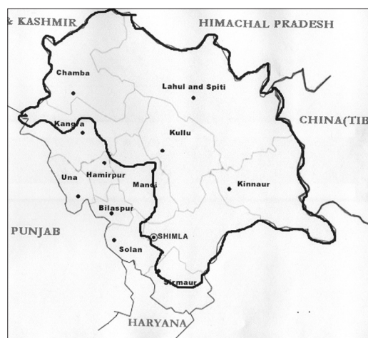
Figure-2: Map depicting the breeding tract of hill cattle of Himachal Pradesh.