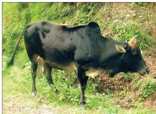
Figure-1: Adult hill cattle of Himachal Pradesh.

Where, Y is the phenotypic observation for one of the 17 biometric traits, \mu is the overall mean, D_i is the fixed effect of district, while e_{ij} is the random residual error associated with each observation which is normally and independently distributed with mean zero and unit variance. Means, standard error and coefficient of variation were calculated. Pearson's correlations (r) among various morphometric traits were estimated.