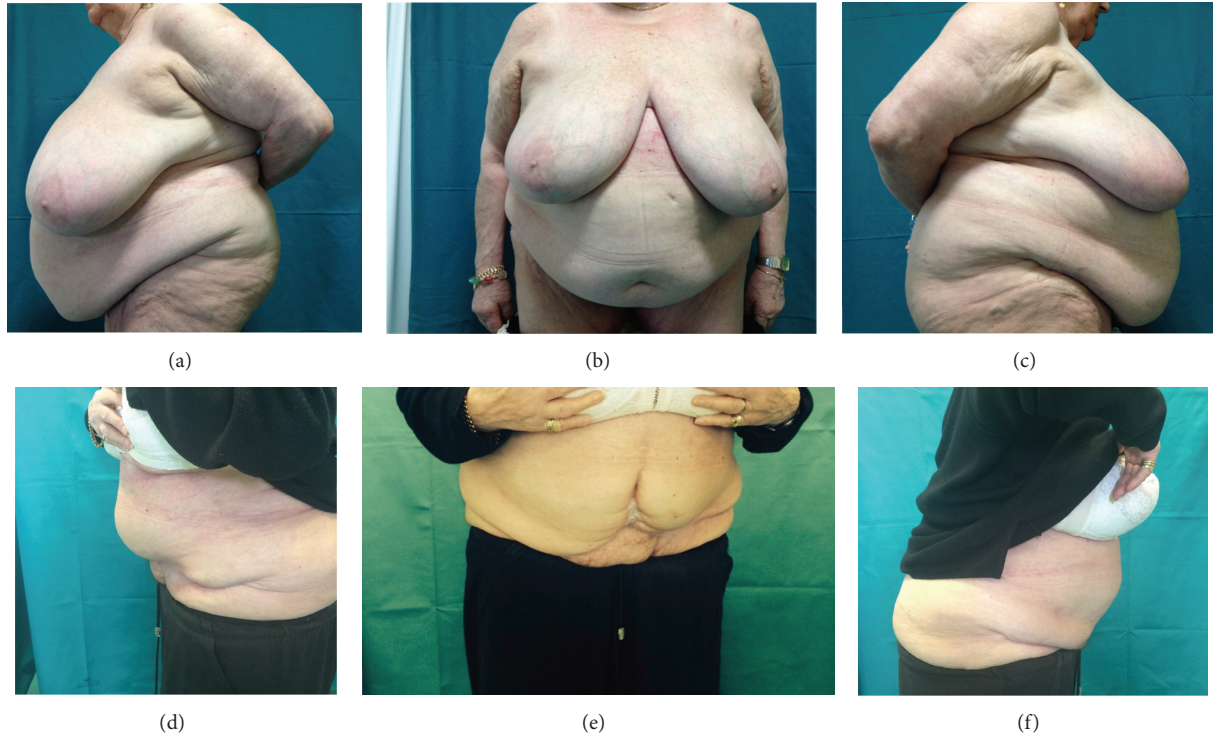
FIGURE 2: Patient with wound dehiscence: (a) + (b) + (c) preoperative case; (d) + (e) + (f) postoperative case.