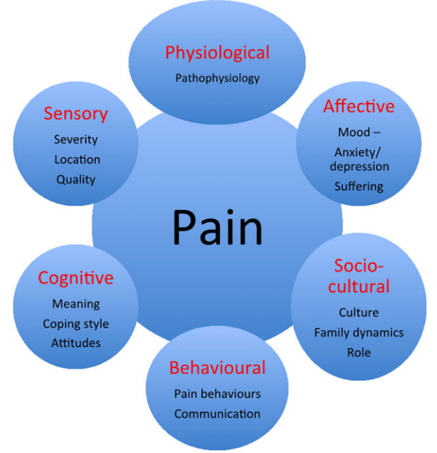
Figure 1 The multi-dimensional concept of 'total pain'.

and socio-economic impact of chronic pain is considered to be at least as great as that of other established healthcare priorities, including cardiovascular disease and cancer (Breivik et al., 2013). Pain reduces patient quality of life, preventing many from leading an independent lifestyle. This can also negatively affect the lives of their family, friends and co-workers (West et al., 2012). The Declaration of Montreal states that pain management is inadequate across most of the world (IASP, 2012).