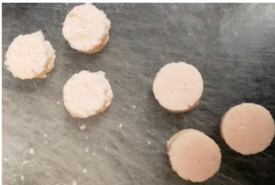
Figure 3. Sections of the cooked meat made with minced SM poultry breast meat ( left : SM, right : SM + caseinate).