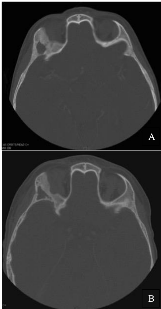
Figure 2. Skull CT before (a) and after (b) 2 courses of pamidronate therapy. a) Permeative bone lesions in the lateral wall of orbit and soft tissue mass involving the right lacrimal gland and lateral rectus muscle. b) Bone remodeling and reduction in orbital soft tissue mass

parathyroid hormone (PTH) levels following alendronate.