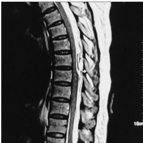
Figure 1: Epidural haematoma as seen on MRI

In some case reports, patients have been managed conservatively. In our case, in spite of early diagnosis and surgical intervention,