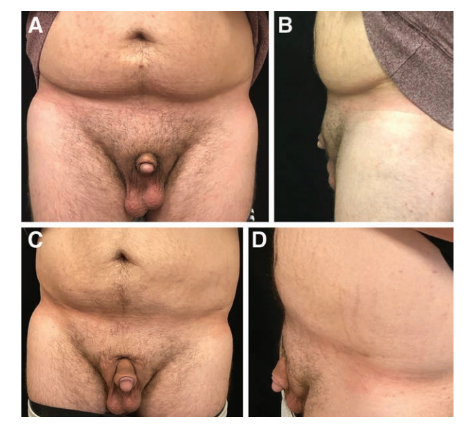
Fig. 3. Enlargement of a micropenis (frontal and lateral views). Preoperative photographs: (A) front view and (B) lateral view. Postoperative photographs: (C) front view and (D) lateral view.

We studied 30 cases. The mean patient age was 37.4 years (range 21–65 years). The mean body mass index was 27.3 (range 21.8–33.8) (Fig. 3). Smokers accounted for 13.3% of patients (Table 1). Anxiety due to penile size and "locker room" embarrassment were the most common causes for consultation. Out of the 30 men, 10 had undergone an evaluation by a psychiatrist preoperatively to rule out body dysmorphic disorder. The average preoperative flaccid stretched length was 7.4 cm (range 1.5–10 cm) and at 1-year postoperative the average length was 10.7 cm (range 8–13 cm) (Fig. 4). The flaccid SPL increased significantly postoperatively to 3.4 cm (range 1,5–7 cm), which represented an average lengthening of 62.7% (range 20%–467%). A second enlargement procedure