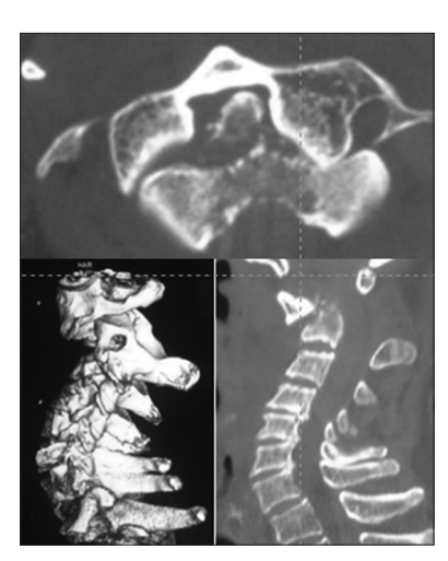
Figure 2: Sagittal and axial scans showing an anterior C1-C2 dislocation with an odontoïd fracture