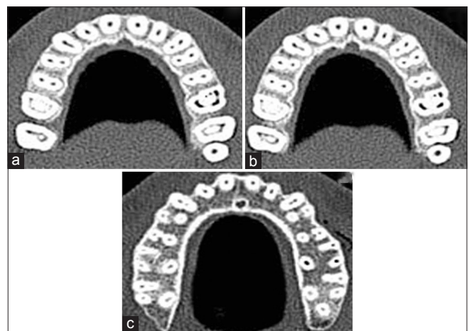
Figure 2: Spiral CT images (a) coronal third, (b) middle third, (c) apical third