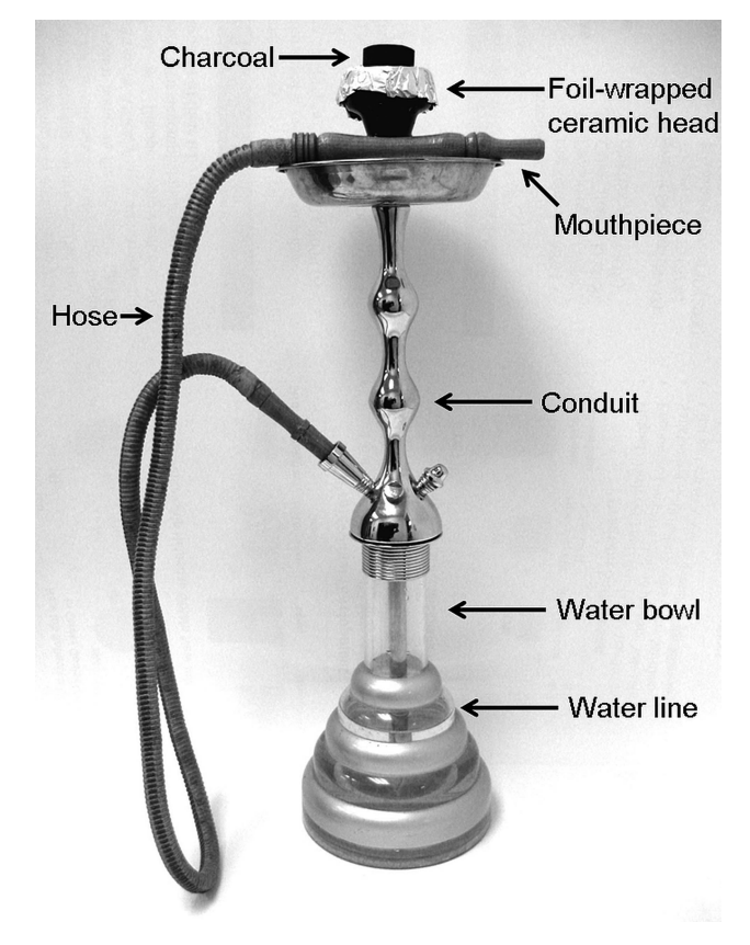
Figure 1 A waterpipe and its component parts.

tobacco smokers are exposed to these toxicants<sup>62–66</sup> and that WTS is associated with disability, disease and death.<sup>67–69</sup> This literature has been summarised previously<sup>25</sup> <sup>26</sup> <sup>55</sup> <sup>70</sup> and the most up-to-date review can be found elsewhere in this issue.<sup>71</sup> The purpose of this review is to examine if, like tobacco cigarette smoking, WTS supports nicotine/tobacco dependence. If it does, the same emphasis given to treating and preventing tobacco cigarette smoking in public health programmes should be extended to WTS. Thus this review is intended to help guide tobacco control efforts worldwide. The review first examines WTS and the delivery of the dependence-producing drug nicotine (the primary dependence-causing agent in cigarette smoke<sup>17</sup> <sup>19</sup>) and then focuses on the extent to which the literature on WTS addresses nicotine/tobacco dependence in waterpipe tobacco smokers.