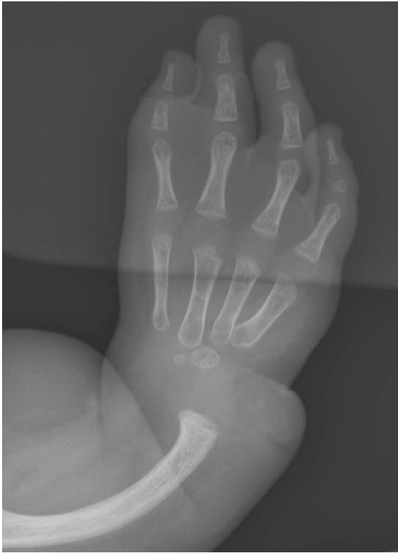
Figure 2. Radial and thumb abnormalities in Fanconi anemia. Absence of the thumb and radius as well as malformed ulna are visible on radiography.

least one in three patients does not have any visible developmental anomalies. They may not come to medical attention until their school years, when they develop clinically significant pancytopenia due to bone marrow failure. Several patients with unusual or treatment-resistant cancers have been diagnosed with FA as adults, indicating that the prevalence of FA is likely underestimated.