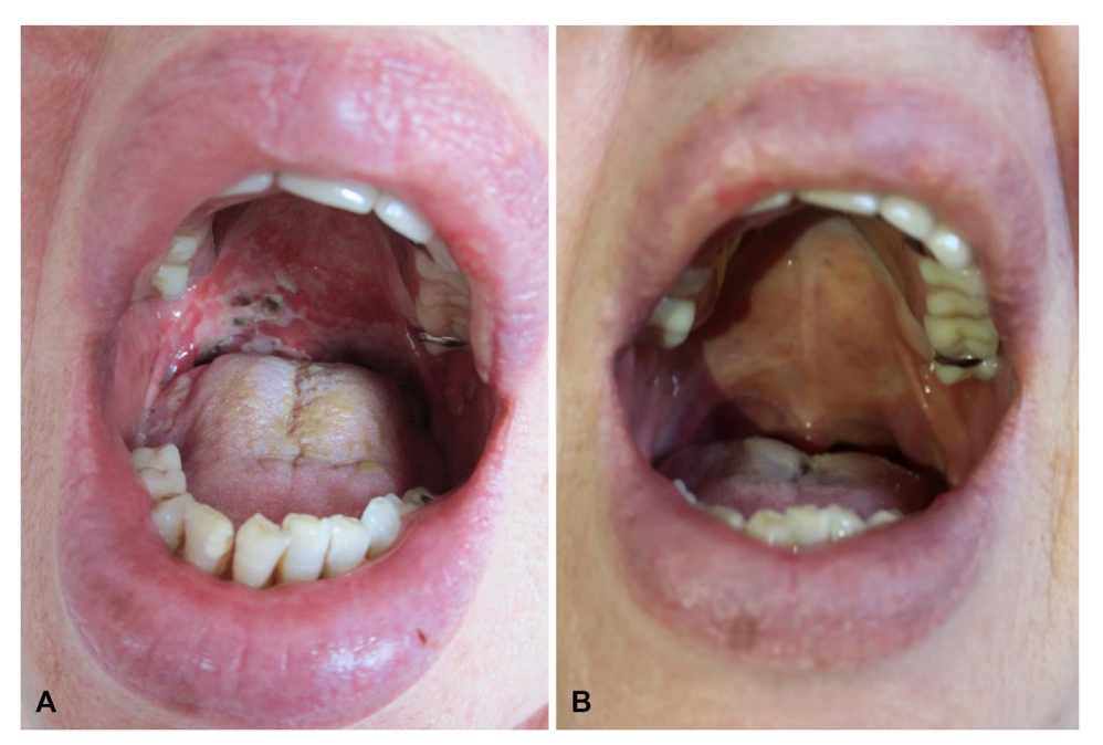
Fig 1. Clinical presentation. A , Initial presentation: extensive fibrin-coated erosions on the hard and soft palate of the patient, ( B ) 21 months after disease onset.