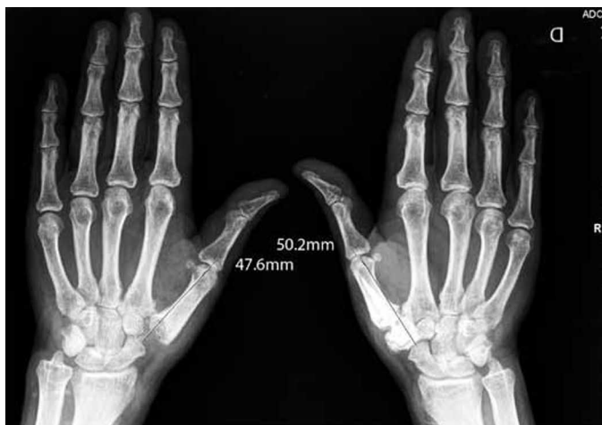
Figure 1 – Patients operated bilaterally using two different techniques.

evaluation was based on four items: pain, function, mobility and strength. Radiographic evaluations were made before and after the operation, using anterior, lateral and stress views. The height difference in the scaphoid-metacarpal column (i.e. the line joining the most distal point on the scaphoid to the most distal point on the first metacarpal) between the two hands of the same patient was calculated (Figure 2). The imaging evaluation also made it possible to assess implant placement, presence of radiolucency lines and preservation of the height of the scaphoid-metacarpal column.