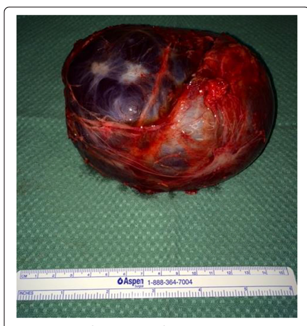
Figure 3 Resected retroperitoneal cyst.

sequelae of a mesenteric or omental haematoma or an abscess which was not resorbed [5,6].