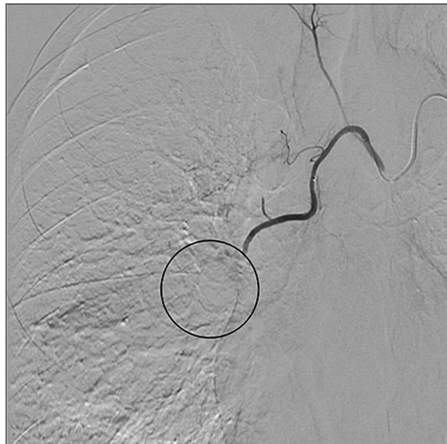
Figure 2 Tumor staining after embolization. Following the embolization procedure, there is a notable absence of staining in the tumor. Circle: Missing tumor staining.