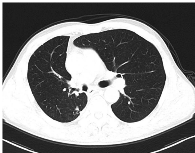
Figure 5 The latest CT examination.

of immunotherapy as a neoadjuvant treatment for NSCLC, which revealed that in patients without epidermal growth factor receptor (EGFR) or anaplastic lymphoma kinase (ALK) mutations, 21% achieved complete response, 7% achieved pCR, and 92% achieved R0 excision. At present, the total response rate (ORR) of different forms of neoadjuvant immunotherapy for lung cancer is very different: the ORR of neoadjuvant immunotherapy, 7 dual immunotherapy and immunocombined chemotherapy 8 is 10%, 22% and 78%, respectively. Therefore, the combination therapy can significantly prolong progression-free survival (PFS) and significantly improve the pCR rate.