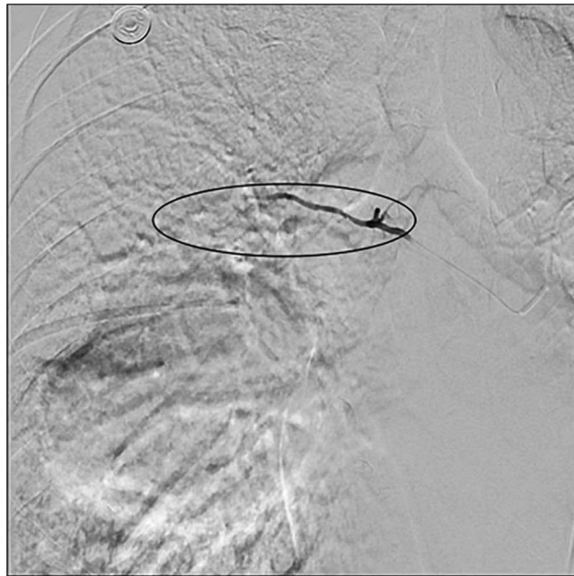
Figure 3 Tumor staining after embolization. Following the embolization procedure, there is a notable absence of staining in the pleural. Circle: Missing tumor staining.