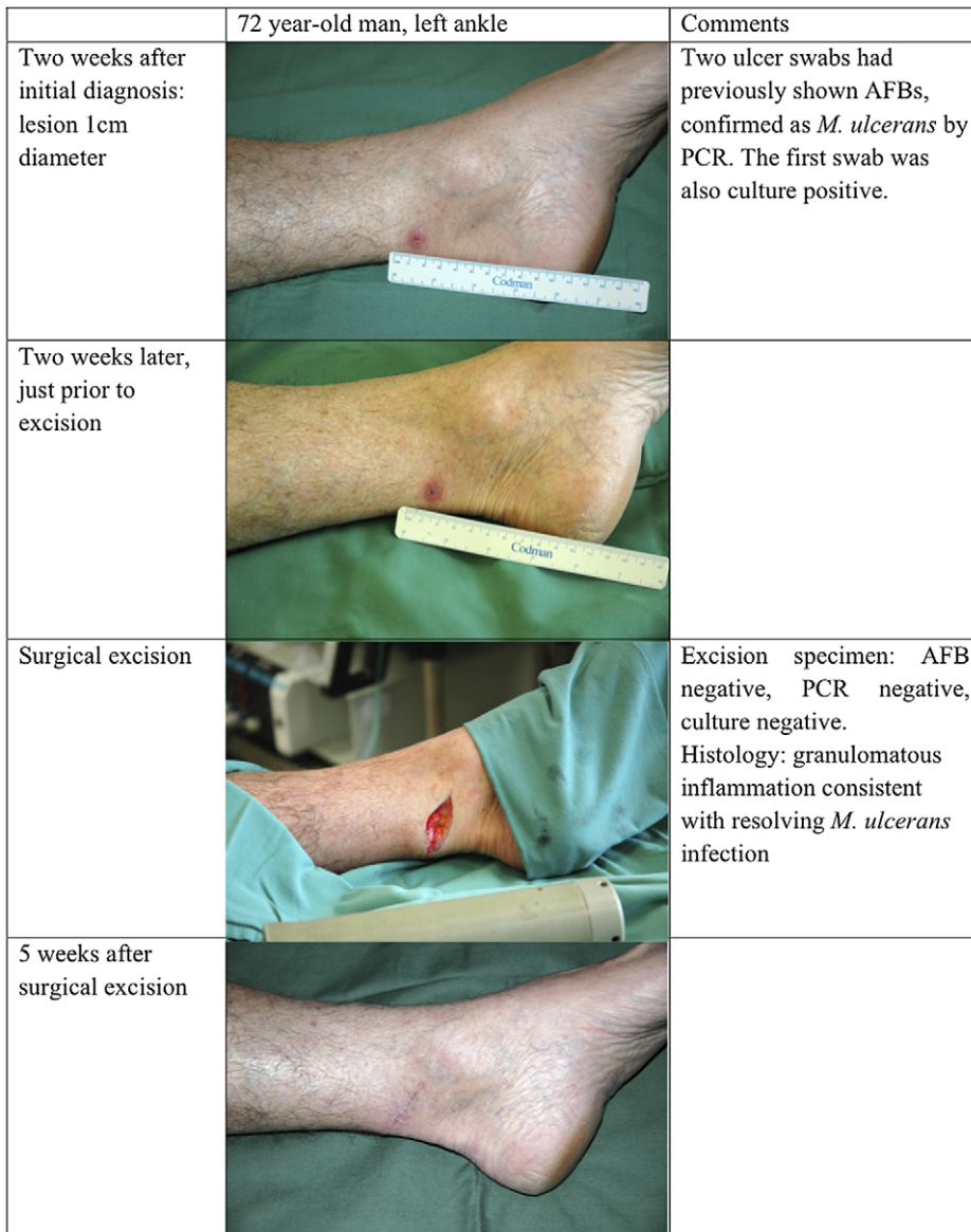
Figure 1. Clinical appearance and laboratory characteristics. doi:10.1371/journal.pntd.0001290.g001