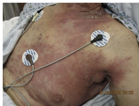
Fig 1. Erythematous and edematous papules coalescing into plaques on the left chest.

An 89-year-old man with a history of atrial fibrillation, gastroesophageal reflux disease, stroke secondary to malignancy and atrial fibrillation, small bowel obstruction, and T3N2 metastatic esophageal adenocarcinoma (AJCC staging system) presented to the emergency department with weakness, left axillary lymphadenopathy, shortness of breath, and pruritic erythematous and edematous papules coalescing into plaques (Fig 1) on the left side of the chest. On review of systems, the patient denied fever,