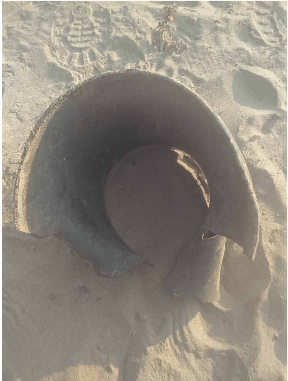
FIGURE 1: Blasted mortar used for the mixing of chemicals at the scene of the first incident.

Both of them were unable to open their eyes at presentation. The clothes of both the victims were burnt at places. Blackening, tattooing, and singeing of scalp hair was evident (Figures 2A-2D ).