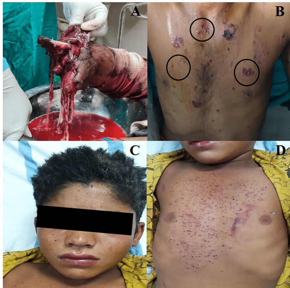
FIGURE 2: Open grade III-c right forearm below-elbow traumatic amputation (A) along with multiple punctate abrasions, contusions, and lacerations (black circles) over the body (B) of elder brother in incident 1. Powder tattooing over the face along with singeing of scalp hair (C) and extensive tattooing over the chest and abdomen (D) of younger brother in incident 1.

The patient (elder brother) sustained a split laceration of size 4 cm x 0.5 cm x subcutaneous deep over the forehead on the left side. Open grade III-c right forearm below-elbow traumatic amputation (Figure 2A) along with multiple punctate abrasions, contusions, and lacerations were present over the front of the body at places, predominantly over the chest and abdomen (Figure 2B). Laceration of size 5 cm x 4 cm x muscle deep was present over the base of the left thumb. At presentation, the patient (elder brother) was semi-conscious and had pulse rate - 90/min, BP - 136/80 mmHg, respiratory rate - 16/min and SpO 2 - 99% on room air. Non-contrast computed tomography (NCCT) head revealed fracture of the outer table of frontal bone without any intra-parenchymal injury. Ophthalmic examination revealed multiple foreign bodies in cornea and hyphema of both eyes with vision 6/24 on the right eye and hand movement vision on the left eye. Local debridement with stump closure and stay suture was done on the right forearm on the same day. A split skin graft was taken from the left forearm and was placed on the right forearm on the fifth day. The patient was discharged on the 10th day with advice of follow up visits. At the time of discharge, the patient diagnosed with corneal melting of the right eye, with vision of 6/60 on the right eye was referred to a corneal surgeon for further management.