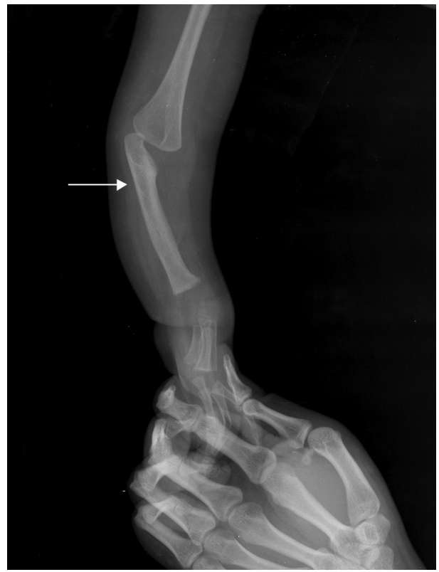
Figure 1. Radiograph of the Upper Extremity Revealed Absence of Left Radial Bones (Arrow)

In conclusion, we report on the first case of horseshoe lung associated with Holt-Oram syndrome. Our findings further expand the phenotypic spectrum of horseshoe lung and Holt-Oram syndrome and suggest that chromosome duplication of 15P may cause this phenotype.