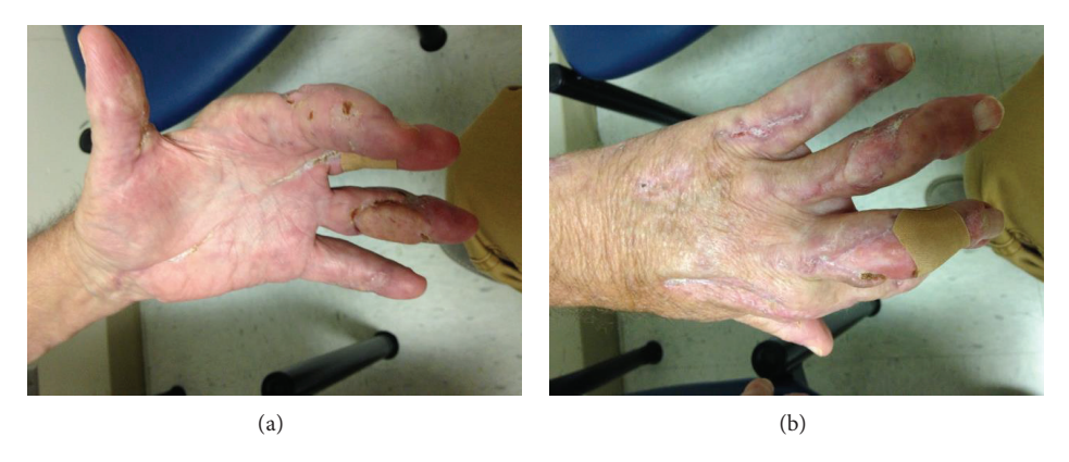
FIGURE 3: Patient's left hand at his 9-month follow-up.