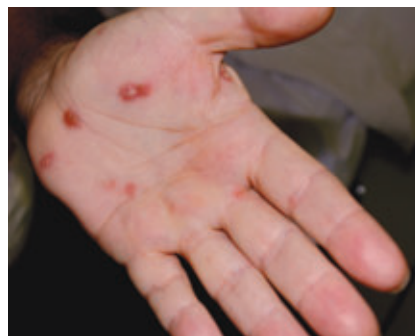
Figure 3. Erythematous papules and nodules on the left palm.