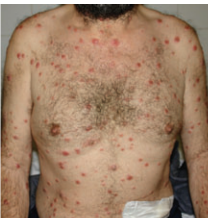
Figure 2. Multiple, erythematous ulceronodular lesions affecting the trunk.