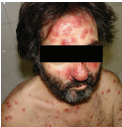
Figure 1. Erythematous ulceronodular lesions on the face producing a leonine facies.

120/80 mmHg, heart rate 100/minute and respiration rate 15/min. He also complained of general malaise, headache, myalgias and loss of approximately 8 kilograms within the last 3 weeks. A 4mm punch biopsy was taken from the margin of an ulcerative lesion and histological examination showed dilatation of blood vessels with perivascular dermal infiltrate composed of many plasma cells (Figure 5).