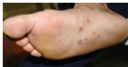
Figure 4. Multiple papules and nodules on the right sole.

©Copyright E. Rallis and V. Paparizos, 2012 Licensee PAGEPress srl, Italy Infectious Disease Reports 2012; 4:e15 doi:10.4081/idr.2012.e15