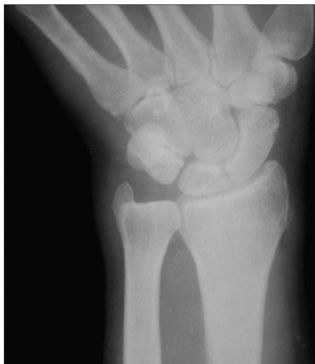
Figure 1: Scaphoid view of the wrist in patient with anatomical snuff box tenderness