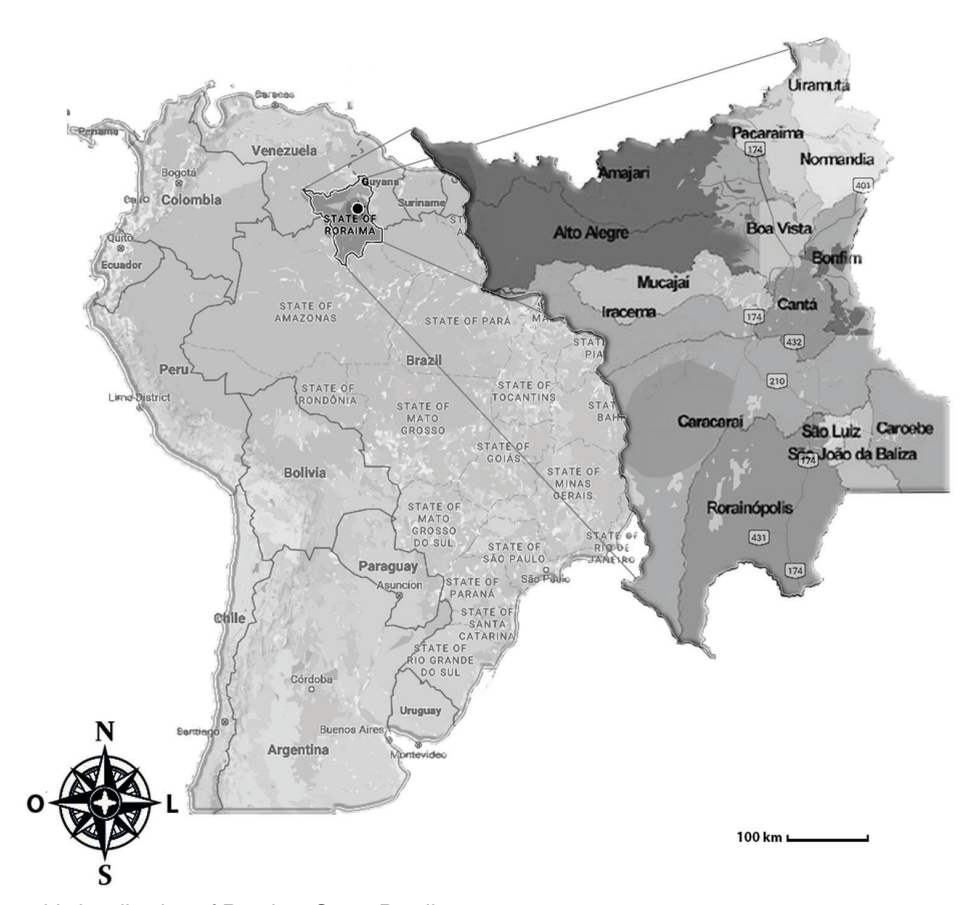
Figure 1 - Geographic localization of Roraima State, Brazil

Roraima State is located in the Amazon region (Figure 1). It is the Northernmost and least populated State of Brazil. It is bordered to the East by the State of Para and Guyana, to the South and West by the State of