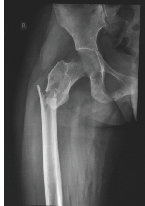
FIGURE 1: X-ray showing the right subtrochanteric fracture.

Her investigations revealed high total calcium and urinary calcium excretion, with low serum phosphate level. She