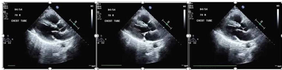
FIGURE 3: Echocardiogram showing right ventricular free wall hypokinesia

While on ECMO, labs including arterial blood gas (ABG), complete blood count (CBC), chemistries and coagulation parameters were drawn every four to six hours. His PaO 2 improved over the next few days and his ventilator settings were decreased to facilitate lung recovery using low tidal volumes or pressure support as needed. Anticoagulation was maintained using a heparin drip target anti-Xa level of 0.3-0.7 U/mL, followed by bivalirudin infusion with target partial thromboplastin time (PTT) 50-65 seconds. Red blood cells were transfused as needed to maintain hemoglobin (Hb) above 7 g/dL.