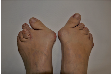
FIGURE 1: Deformities involving the toes on both feet.