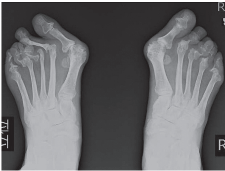
FIGURE 2: Plain radiographs of the feet.