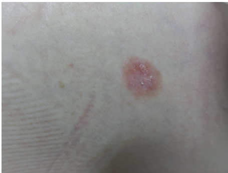
FIGURE 3: The rash on the chest.

suspected, a skin biopsy of the chest was obtained that showed parakeratosis, hyperkeratosis, and regular acanthosis. Histologic findings were consistent with psoriasis (Figure 4). From the results, she diagnosed PsA with mutilans deformity. After treatment with adalimumab, the skin rash resolved and the pain was relieved.