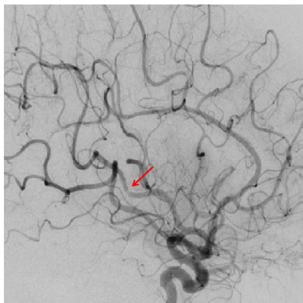
Fig. 2. A transfemoral cerebral angiography image of patient 17 showing multifocal arterial narrowing of the cerebral arteries.

olution of vasoconstriction. The time to resolution of symptom ranged from 2 days to 4 months, but most patients reported that