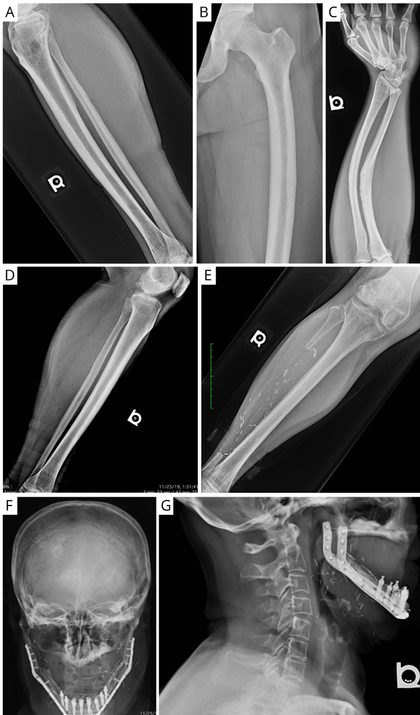
Figure 3 Bone Radiologic Findings in Patients With AD ANO5-Related Disorder

Radiological findings in the proband (III-1) (A-C) and his mother (II-2) (D-G). Lateral view of right tibia and fibula (A) and AP view of left femur (B) showing diaphyseal thickening and reduced tabulation of the tibia. Lateral view of the forearm (C) showing significant deformities secondary to repeat fractures. Lateral (D) and AP (E) views of left and right tibia and fibula, respectively, of patient II-2 showing mid shaft cortical thickening and a complicated fracture of right fibula. AP and lateral skull views of patient II-2 showing postoperative reconstruction of mandible after debulking of COF (F and G) and severe osteopenia in cervical spine (G). AD = autosomal dominant; COF = cemento-ossifying fibromas.