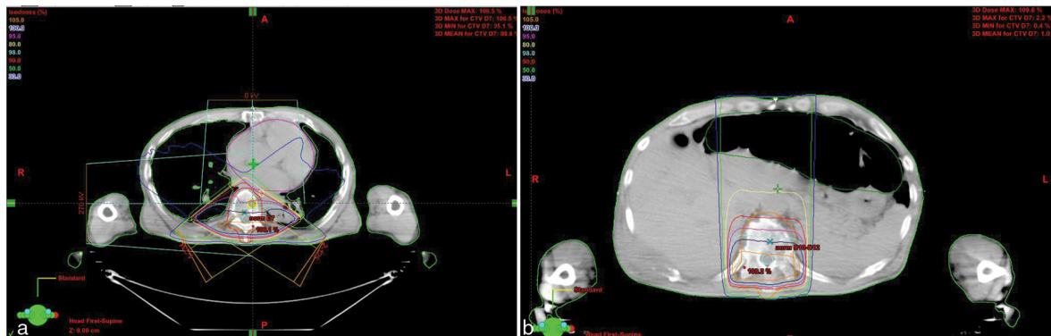
Figure 1. The CT-based plan of three-dimensional conformal radiotherapy using a linear accelerator with 18 MV photon beam. The treatment of T7 was performed using two oblique posterior-anterior fields (a) while the treatment for T10–T12 was performed using a direct posteroanterior field (b). The target volume was contoured by the red line in (a) and orange line in (b). The red and yellow isodoses encompass the area covered by 90% and 80% of the prescribed dose, respectively.

symptoms were present but vertebral lesions were at a high risk of fracture with consequent spine compression. In February 2009, he was diagnosed with two nodular melanomas in his back, which were treated with local excision. Thereafter, he remained free of disease until March 2015. At that time, he underwent CT/positron emission tomography scans for persistent pain in the lower back region with impaired deambulation, which was treated using anti-inflammatory drugs with no clinical benefit. The CT/positron emission tomography scans showed multiple metastatic lesions (brain, bone, lymph nodes and skin). Biopsy from a skin metastasis site revealed a BRAF V600E-mutated melanoma. Therefore, systemic therapy with dabrafenib was started at a standard dose (150 mg twice daily) while it was planned to start the MEKi (trametinib) after 2 weeks within the expanded access program. In our patient, trametinib was administrated about 5 weeks after the end of radiation course.