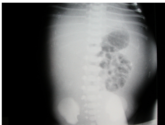
Figure 1 Abdominal radiograph taken 1 hour after birth, shows mottled calcification in the right upper quadrant, curvilinear calcification in the left flank and several loops of non-dilated bowel, but no free gas.

A second radiograph was performed approximately 4 hours after birth because of increasing abdominal distension in the neonate. On this second radiograph, free gas was visible in the peritoneal cavity (Figure 2). The surgical team was subsequently contacted.