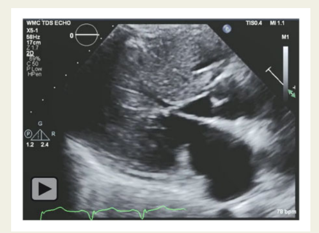
Video I Parasternal long-axis view demonstrating mitral valve anterior leaflet systolic anterior motion.