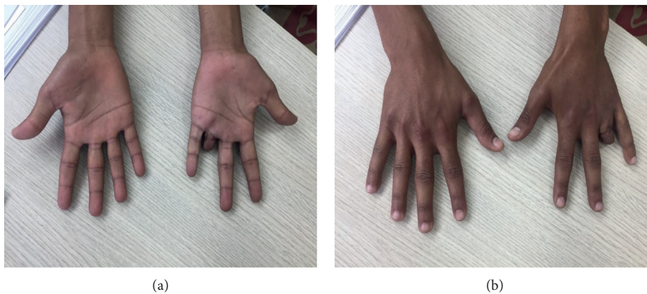
FIGURE 3: (a, b) Clinical aspect at a follow-up of three months.

normal saline and a few authors recommend antiseptic solutions [13]. As it may lead to the uncontrolled spread of bacteria into deeper tissue layers, irrigation under pressure is inadvisable [14]. For surgical debridement of the limb, it is recommended to be extensive [15]. For wound closures on the limbs, the existing recommendations are still inconsistent [16]. Our patient has benefited initially from the first cleaning by a normal saline and then acheminated to the operative room for an extensive debridement with copious irrigation and we elected to close the wound as the patient was young, immunocompetent and was presented early. A follow-up of 24 to 48 hours is indicated to review wound healing and monitor for signs of infection [10].