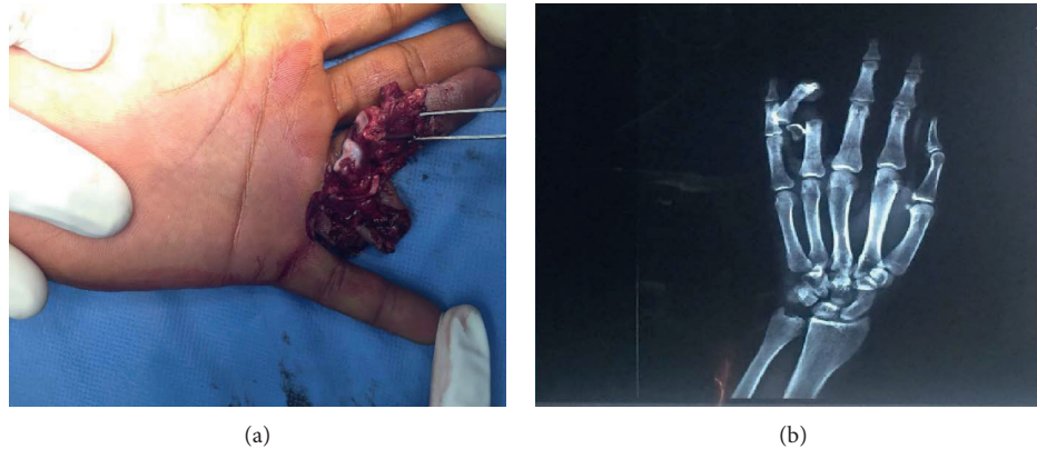
FIGURE 1: (a) Clinical aspect of the crush injury of the fourth finger. (b) X-rays showed a fracture dislocation of the proximal interphalangeal joint with third fragment.

After this initial treatment, radiography revealed a fracture dislocation of the proximal interphalangeal joint of the fourth finger with a third fragment (Figure 1(b)), prompting the patient to undergo surgery. Surgical exploration under locoregional anesthesia found that the ulnar digital pedicle was sectioned and thrombosed, the radial digital pedicle was intact, the flexor and extensor tendons were sectioned and shredded, and the skin was irreparably shredded (Figure 2(a)).