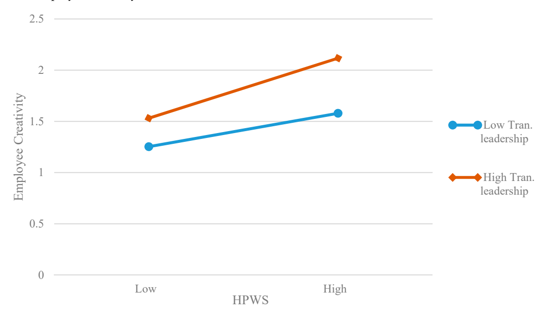
Figure 3. Moderation effect of transformational leadership on the indirect effect between a high-performance work system (HPWS) and employee creativity.